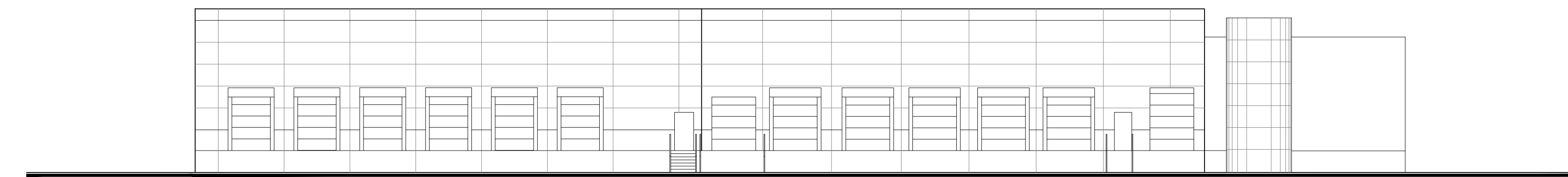
EAST ELEVATION SCALE: 1/8"=1'-0"